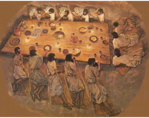
Reclining At the Dinner Table